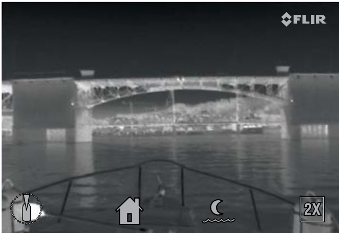
Thanks to small icons conveniently placed at the bottom of the thermal image, the captain can see immediately in which direction the Navigator is looking, whether it is in the "home position" or not. Also other settings of the camera can easily be read from these icons.

The Navigator detects objects in any light condition. Also in broad daylight, the Navigator can detect objects that remain invisible for the naked eye. It is not affected by glare from the sun. The Navigator will allow you to see through the glare, and detect possible obstacles, when navigating during sunrise or sunset.