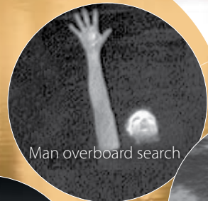
Man overboard search