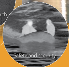
Safety and security