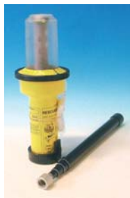
Optional installation with pole