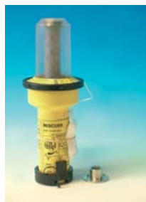
Metal adaptation option