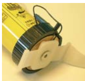
Standard installation with velcro band